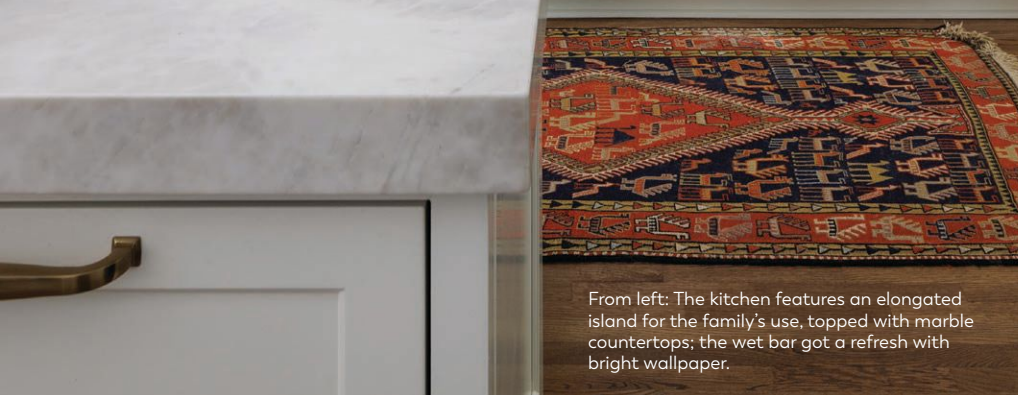
From left: The kitchen features an elongated island for the family's use, topped with marble countertops; the wet bar got a refresh with bright wallpaper.

custom limestone fireplace revamped the surround with the additional placements of a raffia-wrapped side table and abstract art by Elaine Burge. Inspired by the black and brass Viking range in the kitchen, a large hood and similarly shaded black and brass sconces contrast well with a marble backsplash. With sconces in place of island pendants there arose an opportunity to elongate the island for the family's use and incorporate the same marble in the countertops. Eye-catching Schumacher prints, from Aldwyn Damask to the brand's Bixi Dragon, cascade down the window drapery and walls in the dining room and pop in the powder room. Meanwhile, Persian and Turkish rugs dress